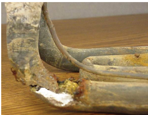
Humidity System Corrosion

If you choose to use any of the techniques listed above, read Thermotron's water quality recommendations to ensure you get the most out of your humidity chamber.