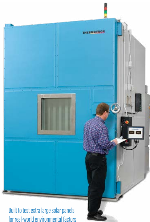
Built to test extra large solar panels for real-world environmental factors

Hinged, sliding, bi-parting, or vertical lift doors