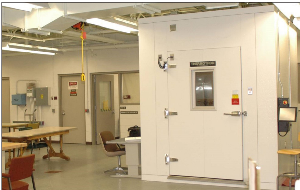
The Thermotron Walk-In Chamber in the Apparel Merchandising and Design Body Scanning Lab at Central Michigan University in Mt. Pleasant, Michigan.