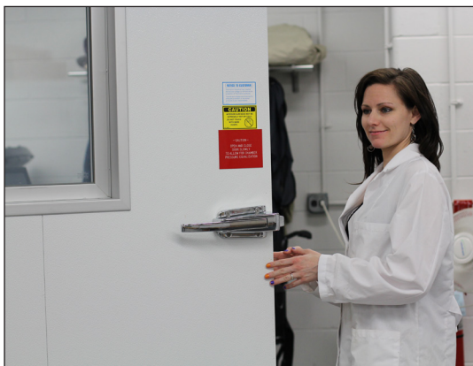
A lab faculty member opens the chamber door to setup a test.