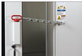
Chain Lock Door