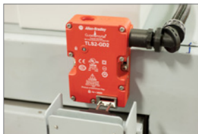
Automatic Door Locks