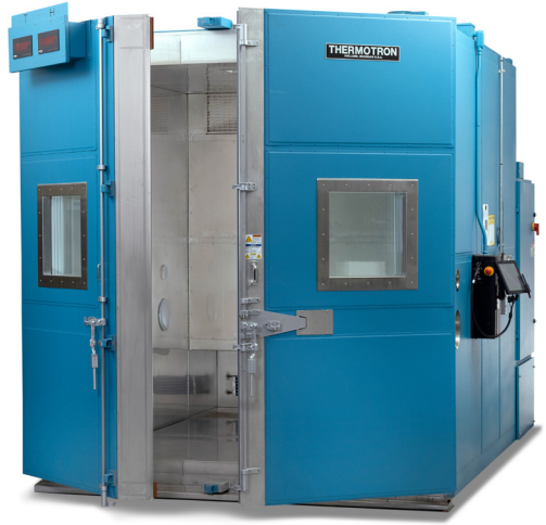
Built to test compressors and vacuum pumps for real-world environmental factors

Available to custom configure your chamber