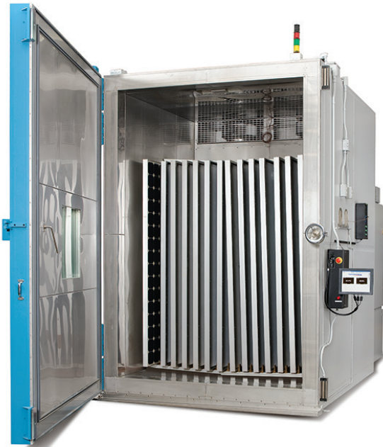
Built to test extra large solar panels for real-world environmental factors

For more than 55 years, Thermotron has provided quality environmental test equipment. We've worked to establish a trusted reputation among our peers, and when people hear the name Thermotron , they have confidence in the testing of their own product. We've been building our name since 1962; now it's your turn.